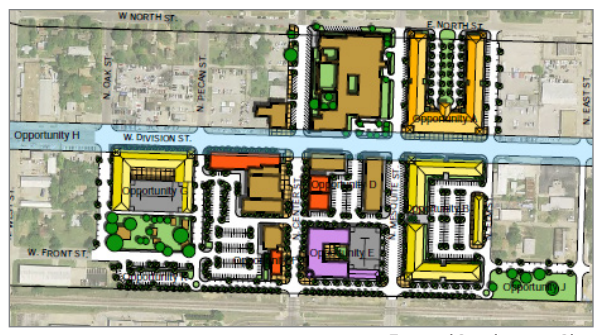
Targeted Development Plan