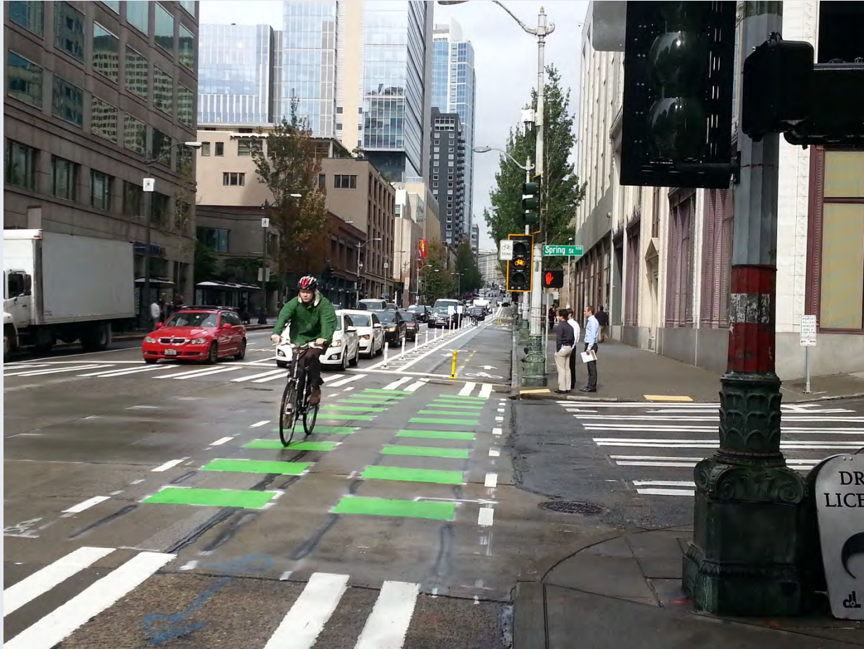
A Two-Way Protected Bike Lane through Downtown