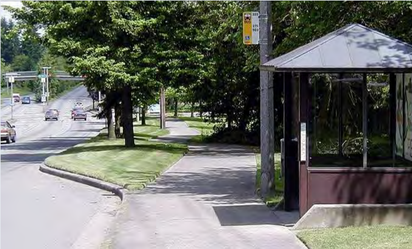
Transit Route on an Urban Arterial