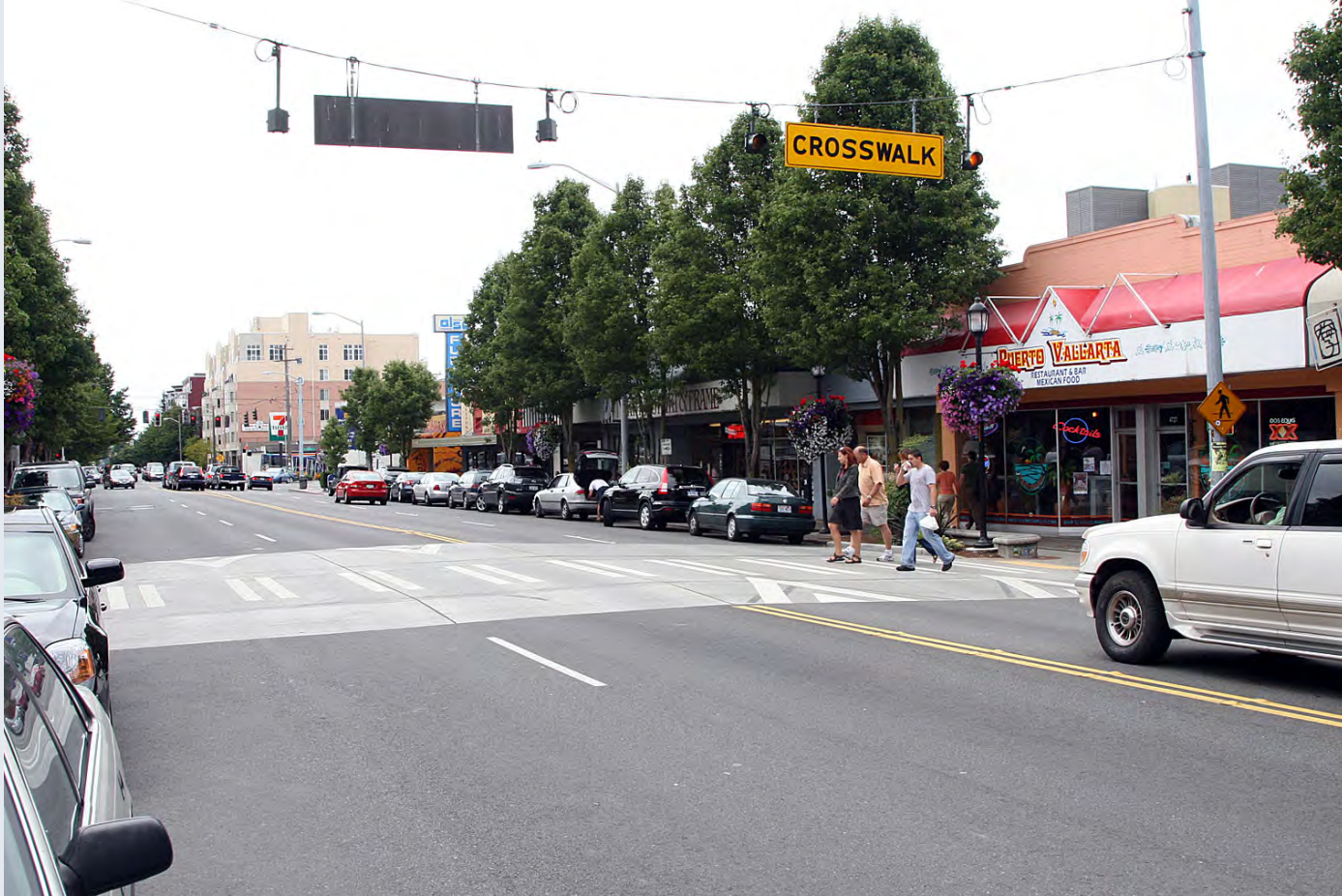
Neighborhood Commercial with Mid-Block Crossing