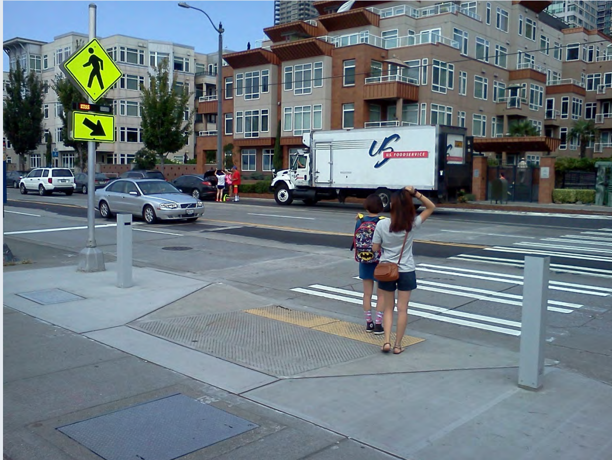
High Density Neighborhood with Mid-Block