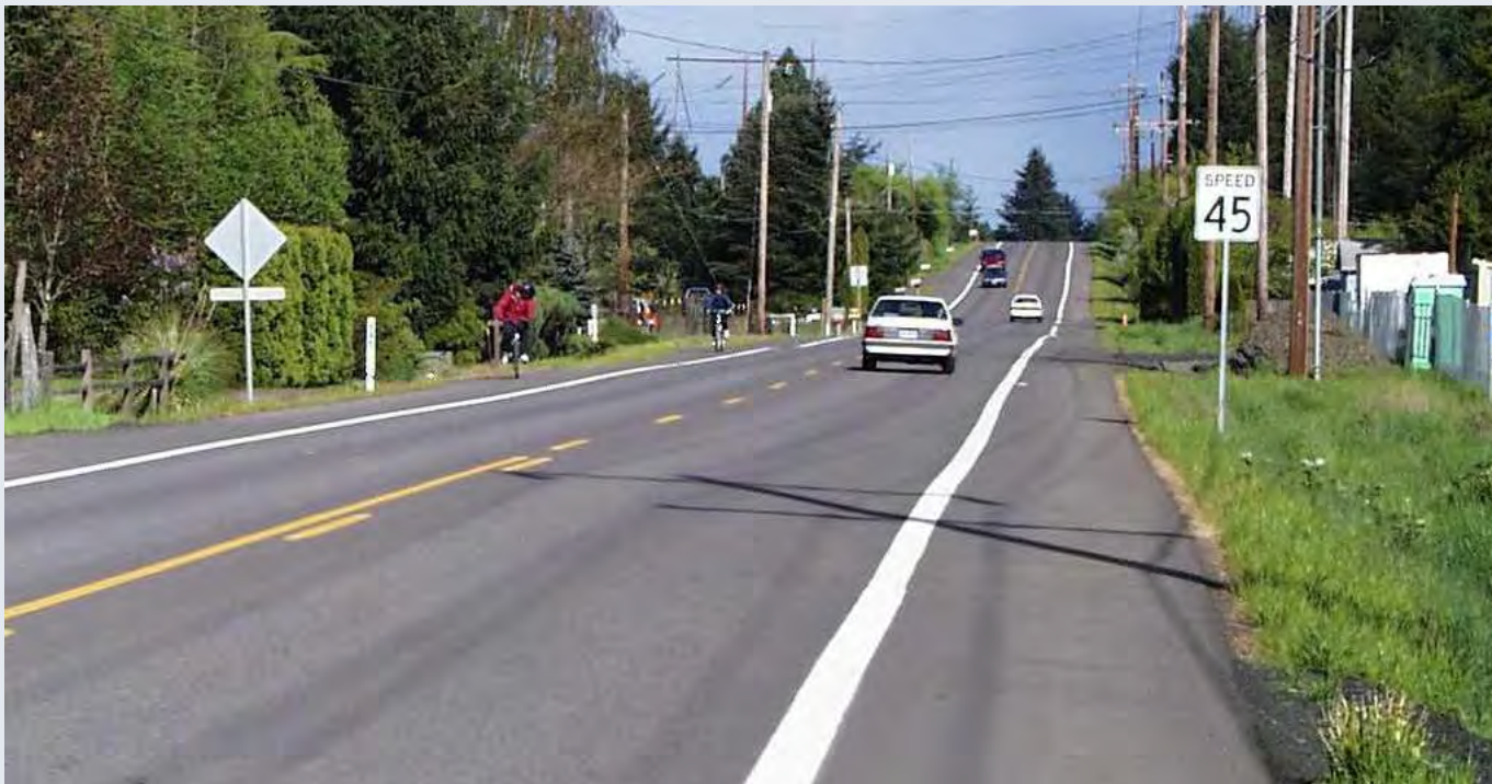
Shoulders on Rural Roads