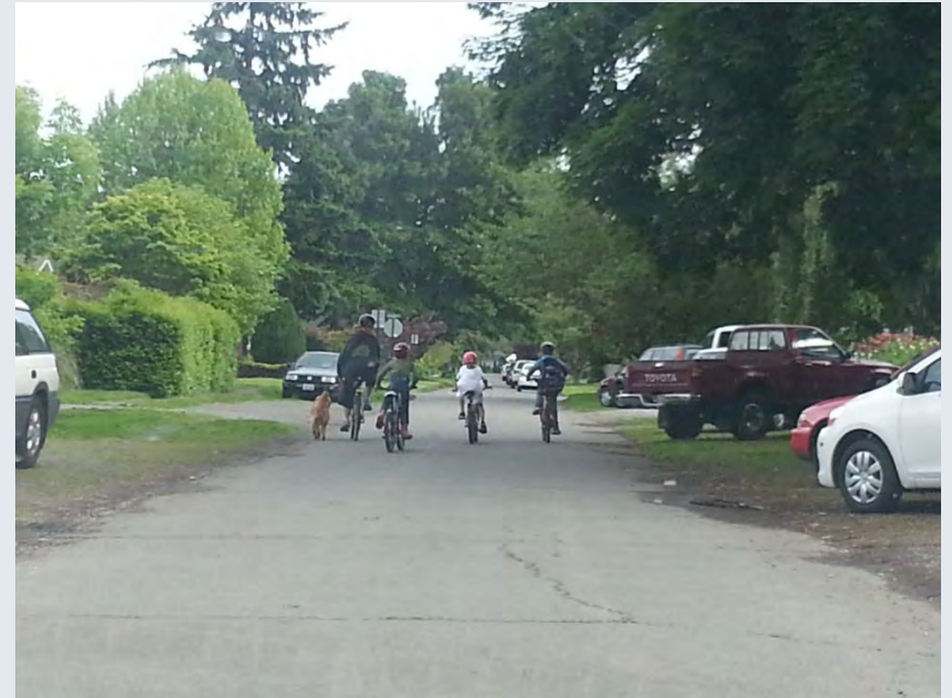
A Slow-Speed Shared Street