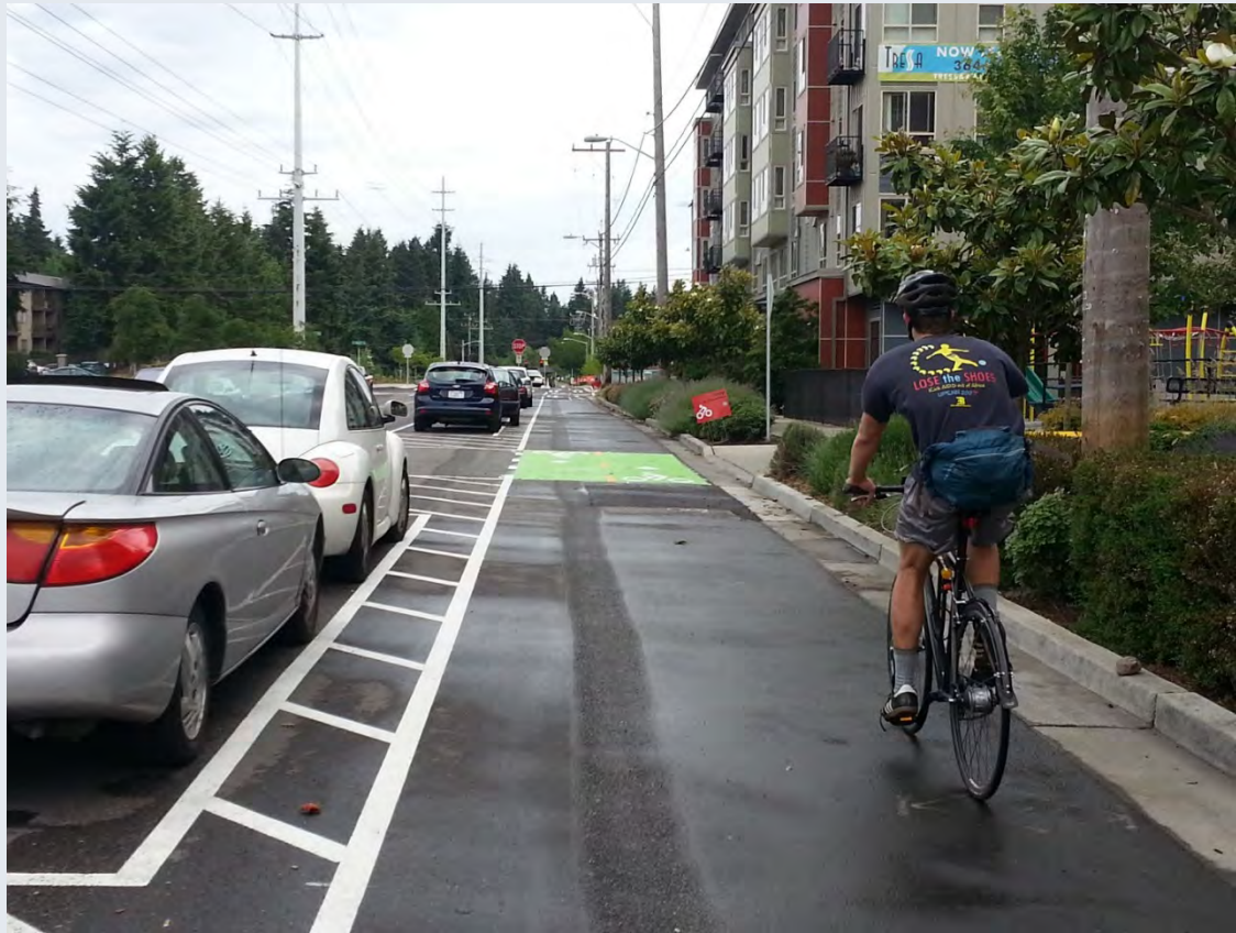
High Density Neighborhood with One-way Protected Bike Lane, Parking and Sidewalk