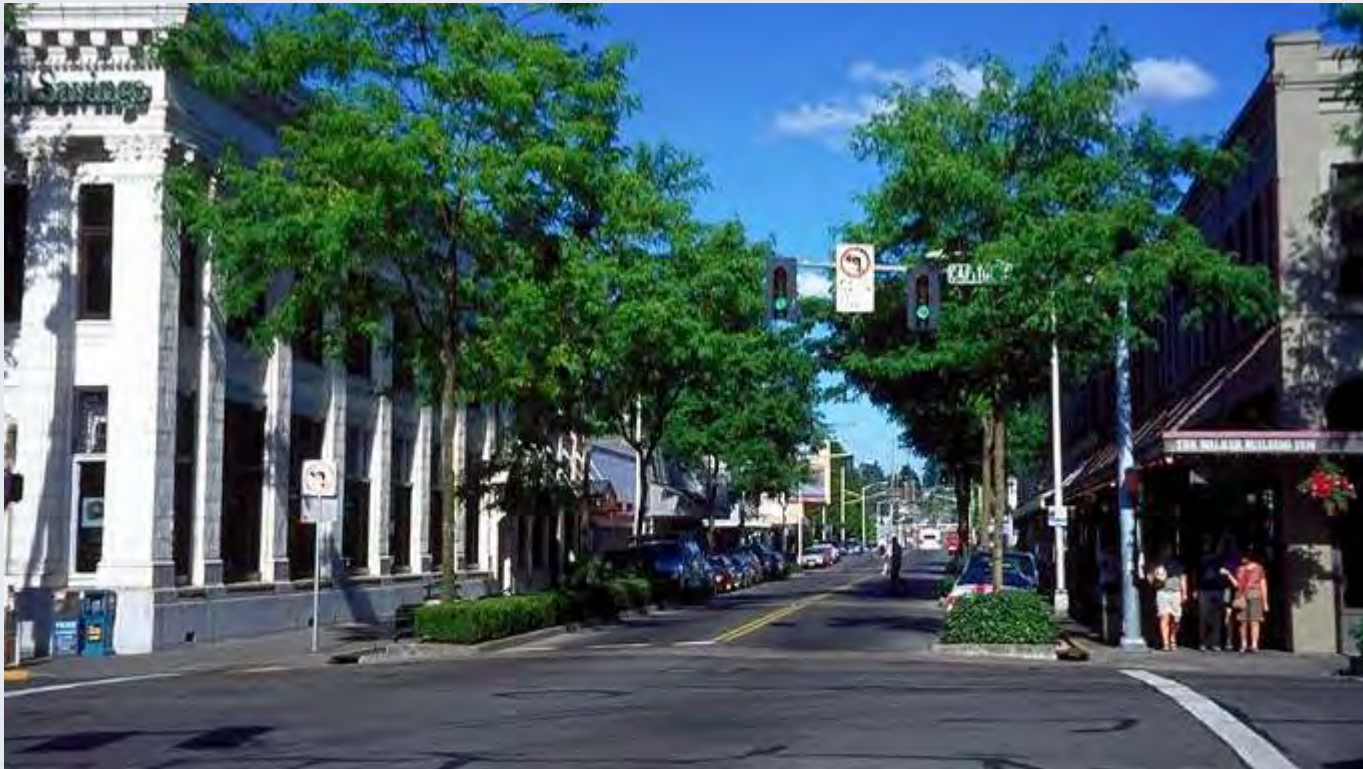
Historic Main Street