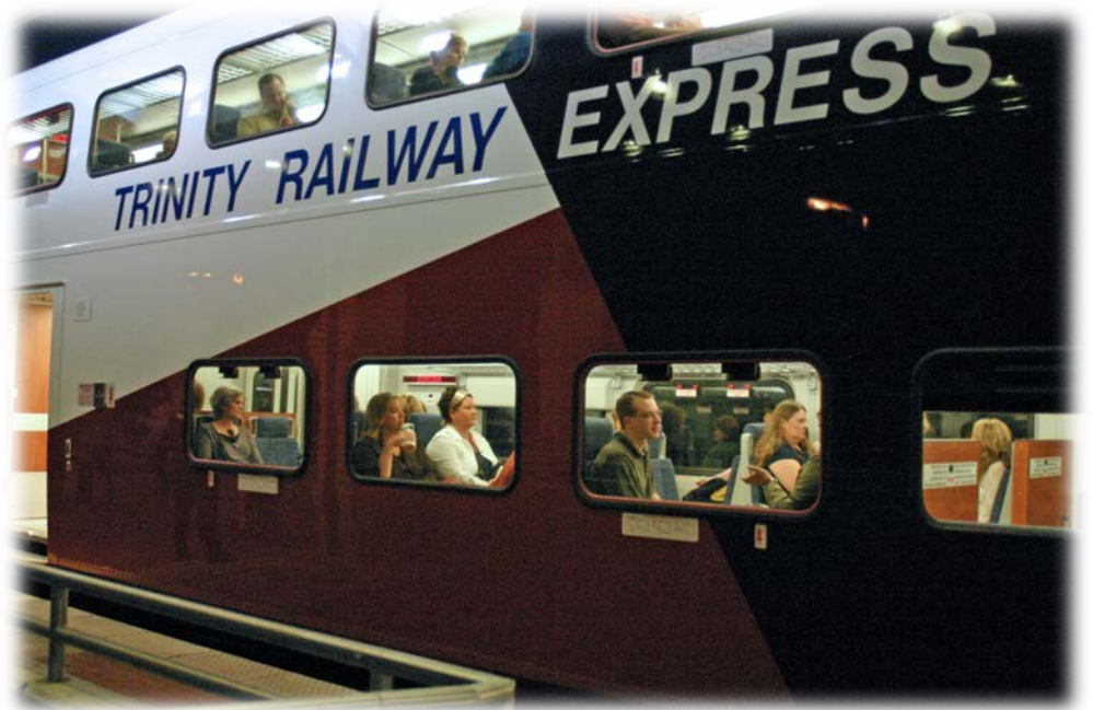
The TRE carries commuters between Dallas Union Station and Fort Worth T & P Station.

certain transportation funding programs. The North Central Texas Council of Governments (NCTCOG) and the Regional Transportation Council (RTC), as the MPO for the Dallas-Fort Worth-Arlington Urbanized Area, the Denton-Lewisville Urbanized Area, and the McKinney Urbanized Area, are assigned project-level programming responsibilities for funding programs that focus on achieving the regional mobility and air quality objectives of the Metropolitan Area. The Texas Department of Transportation (TxDOT) continues to select projects that focus on maintaining and improving the State and National Highway System both in areas outside and within the metropolitan area. Exhibits III-1 and III-2 illustrate the agencies responsible for selecting projects for each of the State and federal funding programs listed in the TIP.