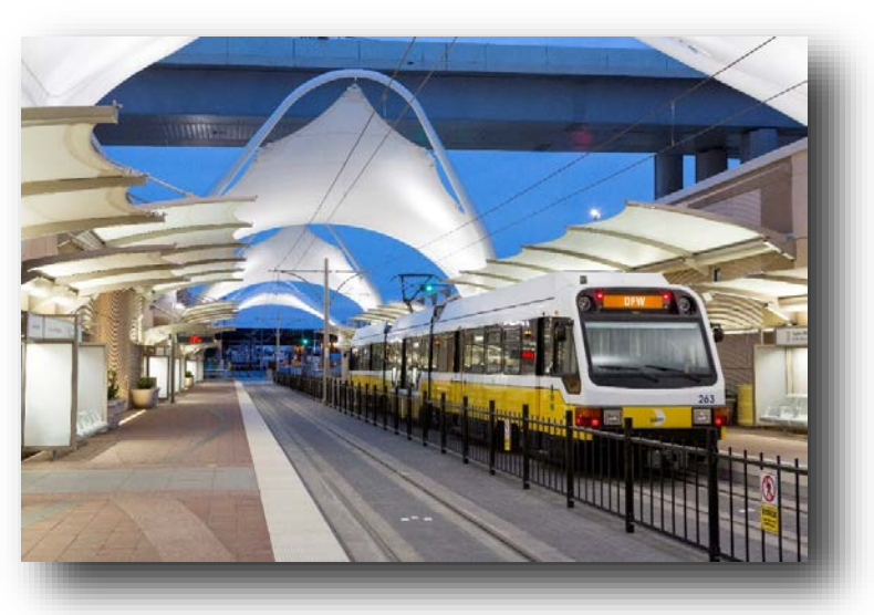
DFW Airport DART Station

After determining that a modification requires RTC action, proposed revisions are submitted to STTC for review. STTC recommends a position on proposed revisions to the RTC. Then, the RTC takes action on STTC recommendations. If rapid turnaround is important, a modification can be submitted directly to the RTC and preclude the normal review processing sequence. In that case, the modification will go back to STTC for concurrence. All modifications are reviewed for consistency with the Metropolitan Transportation Plan (MTP) consistency and air quality conformity. After MTP and air quality review, the revisions and administrative amendments are made available online for public review and comment in accordance with the NCTCOG Public Participation Plan. All modifications that require a revision to the Statewide Transportation Improvement Program (STIP) are submitted to TxDOT on a quarterly basis.