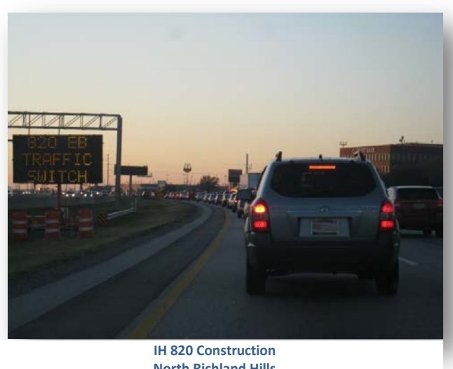
North Richland Hills

The Unified Transportation Program (UTP) is TxDOT's 10-year planning document that guides the planning and development of each TxDOT District's transportation improvements. The North Central Texas area includes three TxDOT District Offices: the Dallas District, Fort Worth District, and the Paris District. Planning rules require that the TIP be constrained by available financial resources in the first four years, while TxDOT, based on State law, programs the UTP over 10 years. Hence, the UTP may contain additional projects beyond those included in the TIP. The TxDOT Dallas, TxDOT Fort Worth, and TxDOT Paris sections of the 2010 UTP are available through the TxDOT Districts and on the TxDOT website. In order for any of these additional projects to move forward into the programming and construction stages, they must be included in the TIP and, subsequently, the Statewide Transportation Improvement Program (STIP).