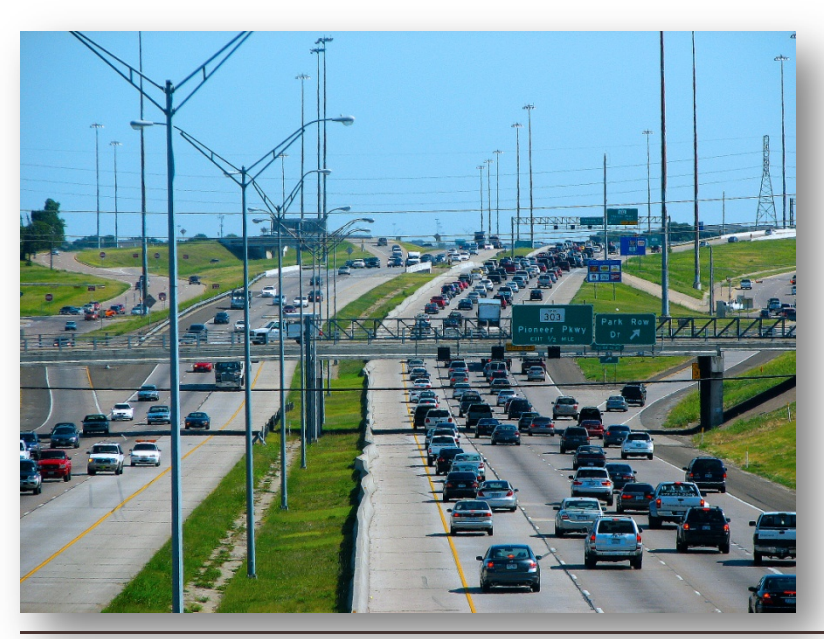
SH 360 Arlington