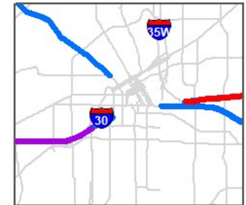
Fort Worth CBD