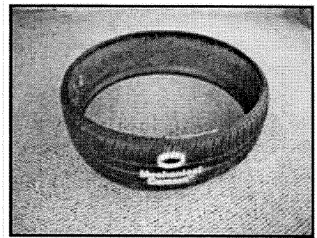
A Mechanical Concrete tire-derived cylinder

A patent application is pending in Canada.