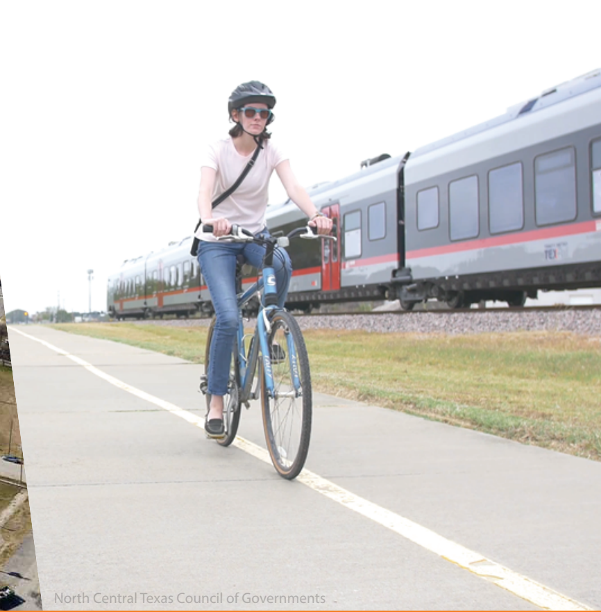
North Central Texas Council of Governments