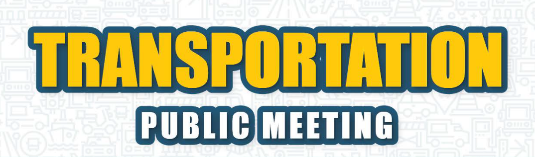
Exhibit II-2. Transportation Public Meeting Flyer for May 2022

MAY 9 · NOON · 616 SIX FLAGS DR. ARLINGTON, TX