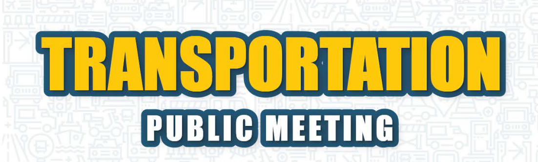
Exhibit II-1. Transportation Public Meeting Flyer for March 2022

MARCH 14 · NOON · 616 SIX FLAGS DR. ARLINGTON. TX