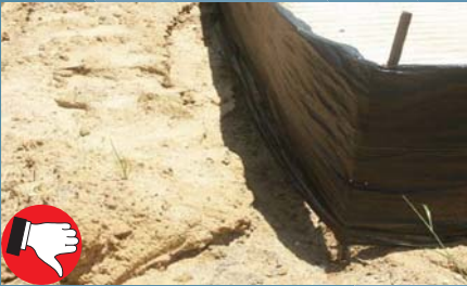
Silt fence is not properly trenched. The lower edge of the fabric must be securely embedded 6 inches in soil.