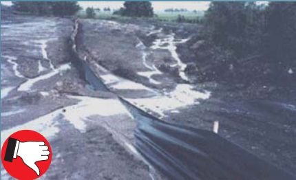
Silt fence is inappropriately installed in an area subject to concentrated flows. A check dam would be more suitable here. There is no wire mesh backing to reinforce the silt fence and wood posts are being used instead of metal.