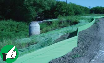
Silt fence is properly installed and is used to reduce runoff velocity and filter sediment before exiting site.

A silt fence consists of geotextile fabric supported by wire mesh netting or other backing stretched between metal posts with the lower edge of the fabric securely embedded six inches in the soil. The fence is typically located downstream of disturbed areas to intercept runoff in the form of sheet flow. A silt fence provides both filtration and time for sediment settling by reducing the velocity of the runoff.