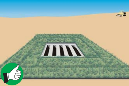
Sod provides immediate protection around storm drain inlets, on slopes, and other areas.

Leaving existing vegetation, where possible, should be given a priority. No other form of erosion control is as effective. Replacement vegetation, used as an erosion control, is the sowing or sodding of grasses, small grains, or legumes to provide temporary and final vegetative stabilization for disturbed areas, and can also be used as slope and channel protection.