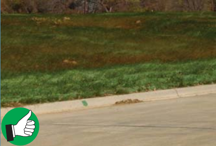
Replacement vegetation is being used effectively as a temporary control.