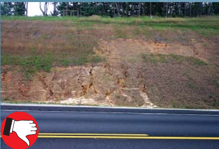
Poor seed establishment on slope. Use seeding in combination with other BMPs (e.g. erosion control blankets) when slopes are steep.